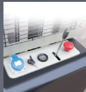
Multi-functional and simple operating platform All control functions integrated for more user-friendly operation