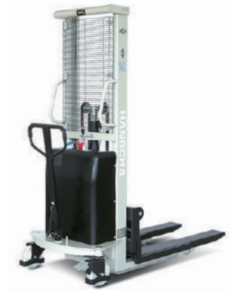
Duplex mast model