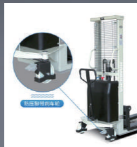
Safety brake function Effectively and safely prevents the vehicle from sliding during unloading or due to terrain.