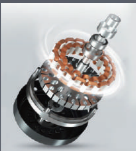
Copper core motor Low energy consumption, high power, low noise